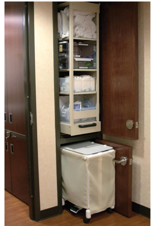
The CoreSTOR system can be configured to each hospital's approach to healthcare. The unit at ThedaCare complements staff workflow and related motion studies.

ThedaCare's new approach to patient care, combined with the CoreSTOR system, creates a streamlined process that results in a comfortable work environment and improved patient outcomes.