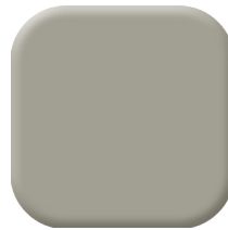
Designer Grey DG (2)