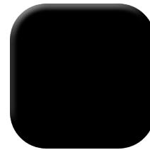
Black BL (7)