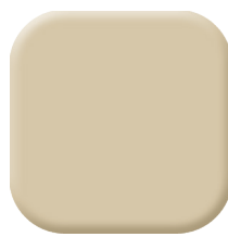
Whisper WP (216)