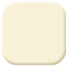
Furniture White FW (15)