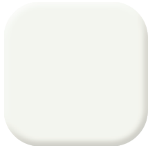
Cottonwood CO (204)