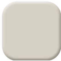
Frost* FR (6)