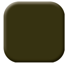
Forest Green FG (84)

*Mobile, Shelving, Doors & Drawers QuickShip color offerings.