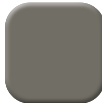
Blue Grey BG (25)