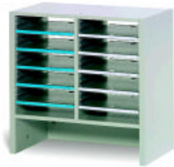
Two section wide Sort Module on platform base