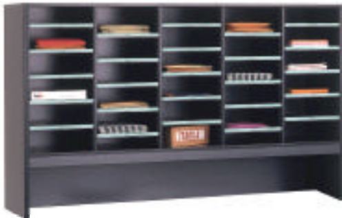
Five section wide Sort Module with solid back and platform base.