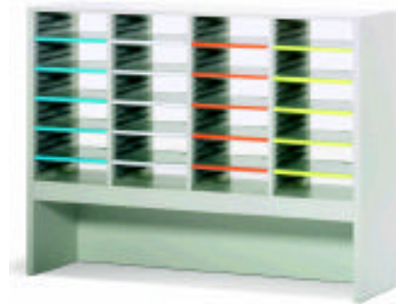
Four section wide Sort Module with transparent back on platform base.